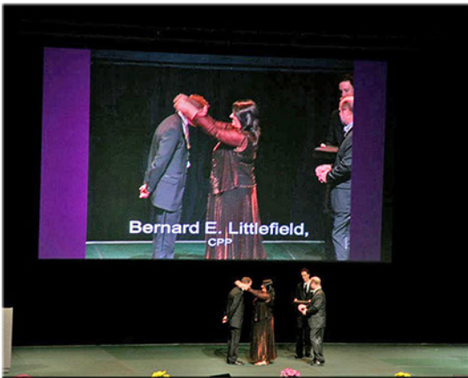
On stage in front of hundreds of my peers (can you say NERVOUS!?)